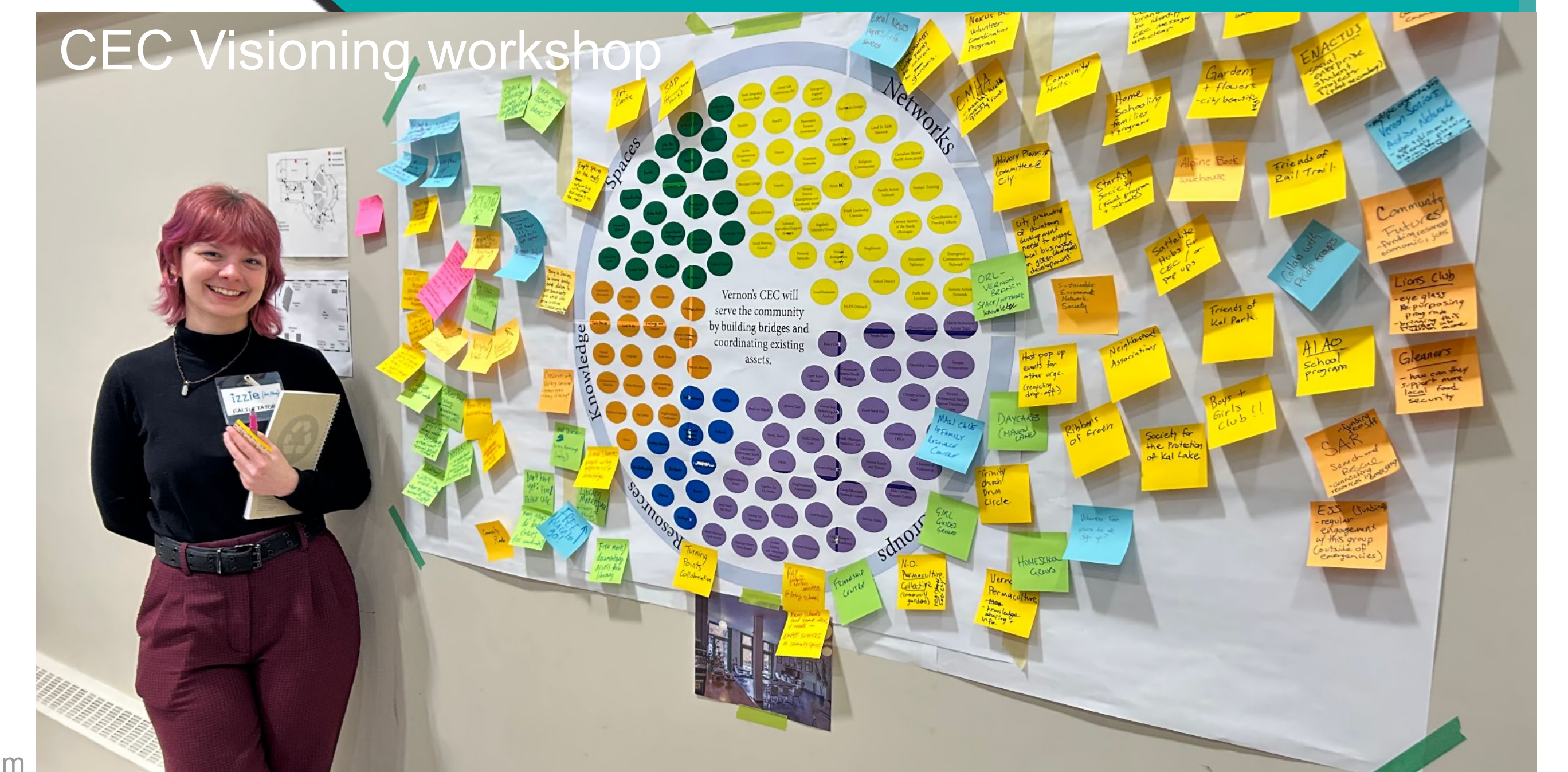
CEC Visioning workshop