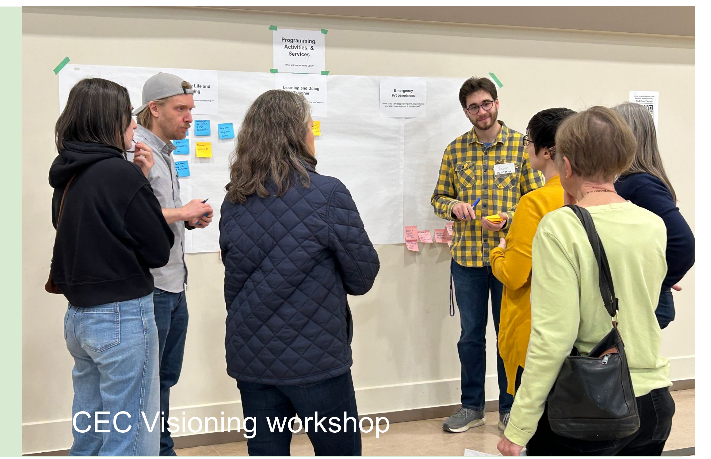
CEC Visioning workshop